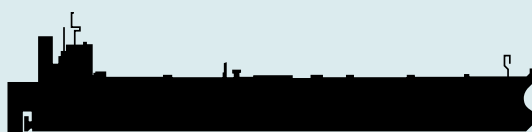
MR 25-45,000 tonnes deadweight

* The weight that can be carried by a ship including cargo and fuel